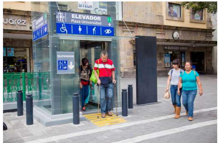
This photo is planned to appear on the front cover.

The Institute for Transportation Development and Policy (ITDP) will soon publish Access and Persons with Disabilities in Urban Areas , part of their series on Policies for Inclusive Transport-oriented Development. The publication is set for release in early 2022 and is an example of the ITDP's increasing focus on equity, access, and inclusion for all.