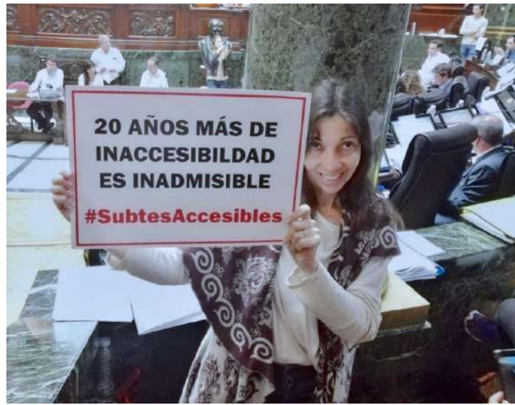
"20 years more of inaccessible subways is not admissible: Accessible Subways!" states this woman's sign at a public gathering in Buenos Aires.

At AEI's virtual Roundtable earlier this year, the advocacy group Fundación Rumbos put a spotlight on issues which have created lack of access to public transport in Buenos Aires, Argentina.