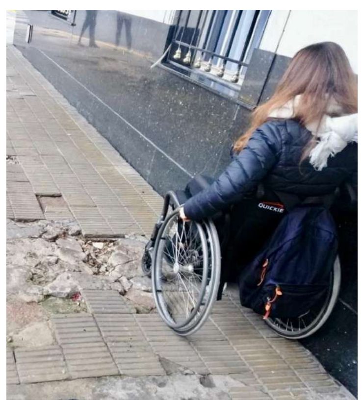
Sidewalks and curb ramps are often broken or defective, advocates state. Buenos Aires is a colonial city and narrow sidewalks compound the problem.

At AEI's virtual Roundtable earlier this year, the advocacy group Fundación Rumbos put a spotlight on issues which have created lack of access to public transport in Buenos Aires, Argentina.