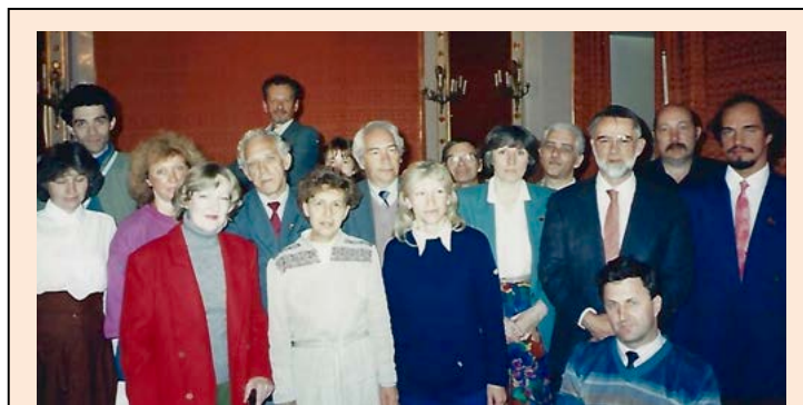
1992: A meeting of social service agencies, disability groups, transit providers, and city government agencies met in Moscow's ornate City Hall to promote a planning process to develop accessible public transit and door-to-door paratransit services for persons with disabilities in Moscow.

Let's not end up using our technologies to destroy ourselves, like we came closer to doing than we realized a few decades ago. May God grant us the wisdom to understand these simple things.