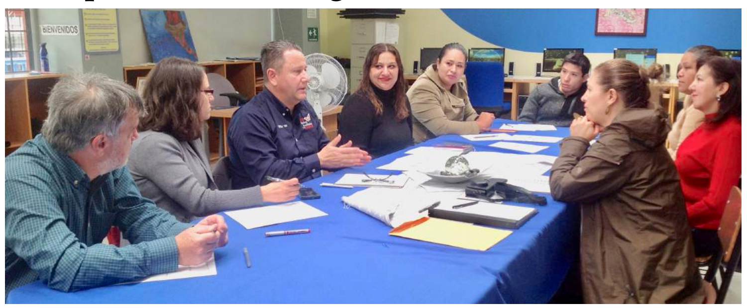
An international team meets with educators, parents and a student in Tijuana to define shared needs.