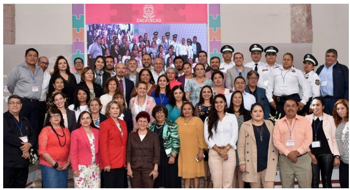
Some of the more than 200 participants in Zacatecas to introduce AEI's guide