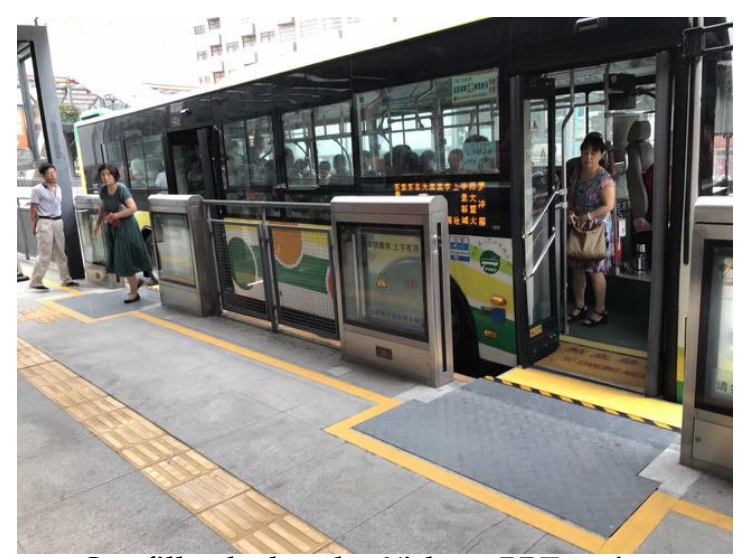
Gap filler deployed at Yichang BRT station