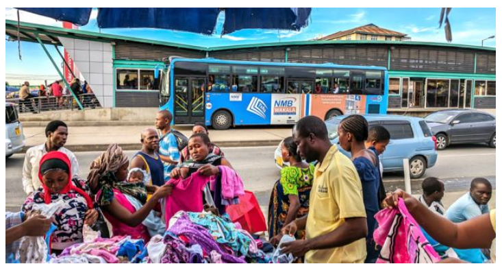
DART's exclusive right-of-way.

AEI's Executive Director visited the BRT planners in Dar es Salaam to discuss DART's access features in 2006. (Yes, this project has been much delayed!) DART will receive a Sustainable Transport Award in January in Washington DC, with Moscow receiving an honorable mention for gains described in a feature in our last newsletter.