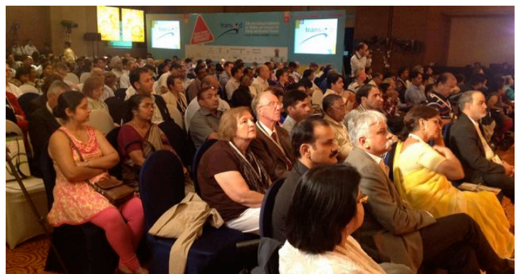
General view of plenary session at TRANSED

After recent conferences in Hong Kong (2010) and India (2012), the next TRANSED will be hosted in 2015 by the Instituto Superior Técnico in Lisbon, Portugal – go to www.ist.eu as the conference takes shape in months to come.