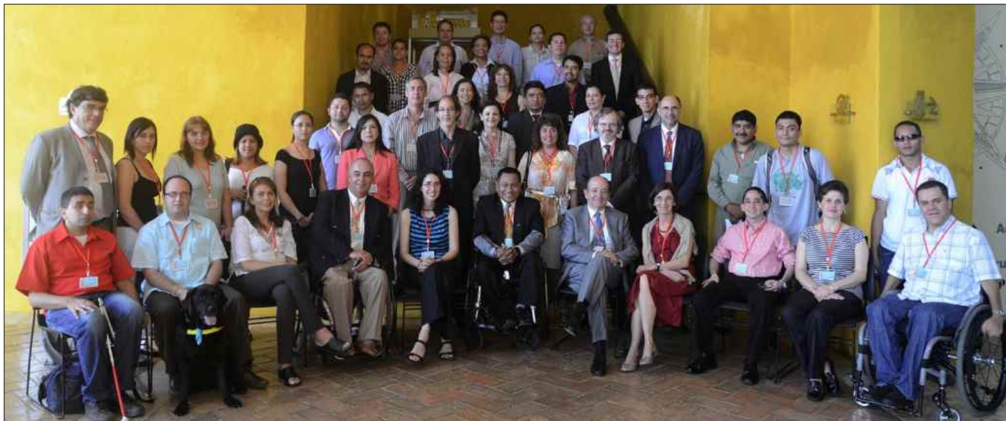
Participants in the Seminar on Universal Access held in Cartagena, Colombia

Accessibility to transport and public space was on the agenda for participants from thirteen Latin American countries at a seminar organized in April with the assistance of the Spanish International Aid Agency (AECID), Spain’s Real Patronato sobre Discapacidad, and the ACS Foundation in Spain. The seminar was held in Cartagena , one of the oldest colonial cities in the Americas. Participants signed an Iberoamerican Declaration Promoting Universal Access (Spanish text available by Googling “Manifiesto Iberoamericano Accesibilidad Universal.”) It is hoped that the conference series can continue with additional events in Peru and Guatemala.