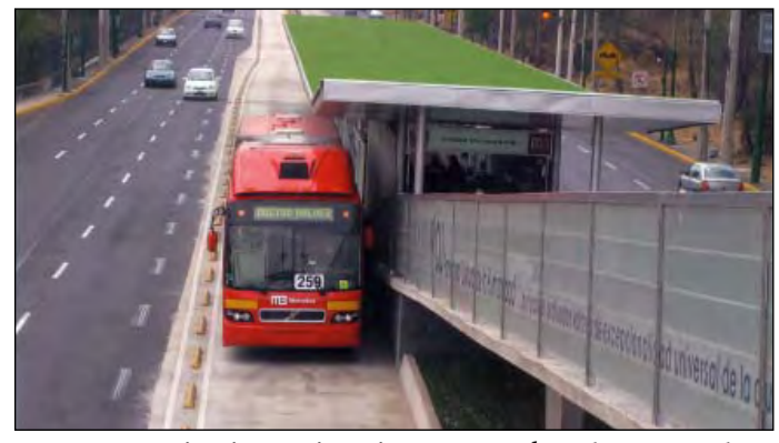
New BRT station in Mexico City